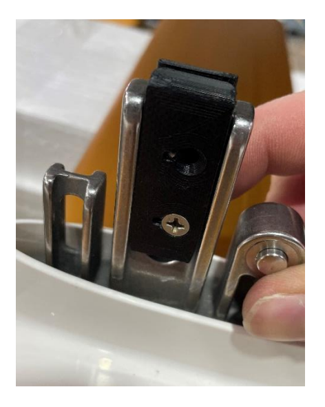
Spacer Up and at its narrowest